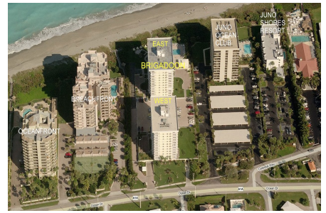
Built in 1977 - 94 units - 12 floors

Brigadoon Condominium 500 Ocean Drive Juno Beach, FL33408 (561) 626-9893 BrigadoonOffice@yahoo.com http://www.brigadooncondo.com/home.asp