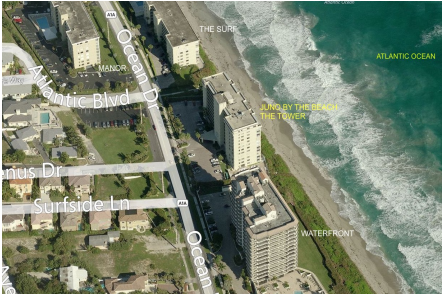
Built in 1973 - 70 units - 12 floors

Juno Beach Tower 840 Ocean Drive, Juno Beach, FL 33408 Office 561-626-0043 http://junobeachtower.com/