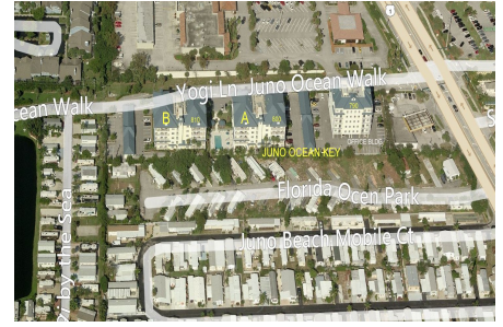
Built in 2006 - 39 units - 5 floors

Juno Ocean Key Condominium 800 Juno Ocean Walk Juno Beach, FL 33408 (561) 694-2137