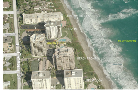
Built in 1995 - 24 units - 13 floors

Ocean Front At Juno Beach Condo Association 570 Ocean Dr, Juno Beach, FL 33408 (561) 627-2880