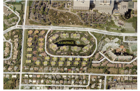
Built in 1984/1996 - 256 units - 4 floors

Ocean Trace Condominium Association Address: 801 Uno Lago Drive, Juno Beach, FL 33408 Phone:(561) 625-4202 http://www.oceantracejuno.com/