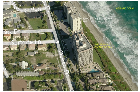
Built in 1996 - 59 units - 13 floors

Waterfront Condo Assc, 800 Ocean Drive Juno Beach, FL 33408 Phone: (561) 626-0059