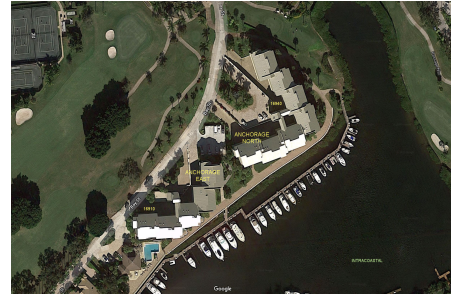
Built in 1981 - 48 units - 5 floors

The Anchorage at Jonathan's Landing 16910 Bay Street Jupiter, FL 33477 Campbell Property Management 401 Maplewood Dr. Suite 23 Jupiter, FL 33458 Phone: +1 561-203-7910 http://anchorageatjl.com/