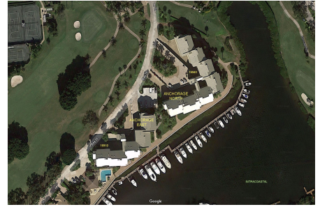
Built in 1981 - 48 units - 5 floors

The Anchorage at Jonathan's Landing 16910 Bay Street Jupiter, FL 33477 Campbell Property Management 401 Maplewood Dr. Suite 23 Jupiter, FL 33458 Phone: +1 561-203-7910 http://anchorageatl.com/