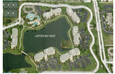
Built in 1986 - 192 units - 4 floors

Jupiter Bay Condominium Association 275 Palm Ave, Jupiter, FL 33477 (561) 746-5857 http://www.jupiterbaycondoassoc.com/id63.html