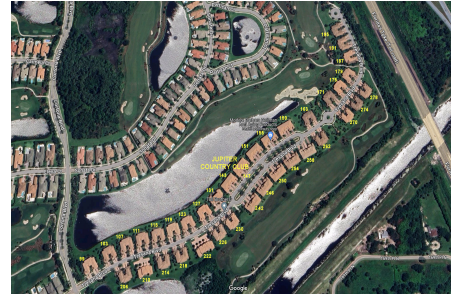
Built in 2008/2019 - 149 units - 1 floor

Jupiter Country Club HOA 280 Cortona Blvd Jupiter, FL 33478 Phone: 561-529-3436