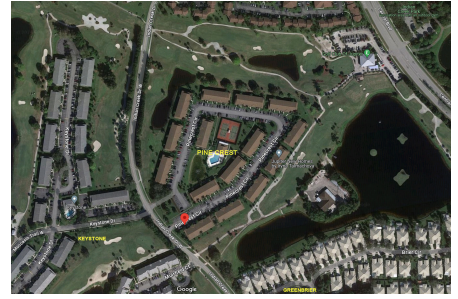
Built in 1987 - 180 units - 2 floors