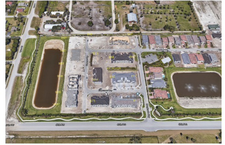
Built in 2018 - 60 units - 2 floors