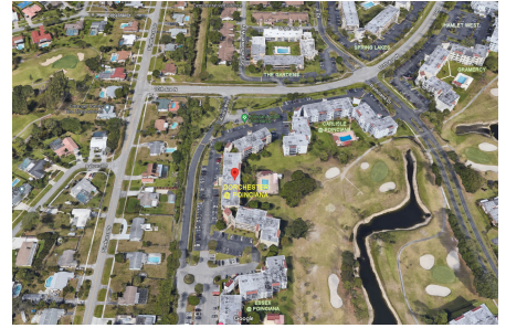
Built in 1981 - 64 units 4 floors

DORCHESTER AT POINCIANA CONDOMINIUM ASSOCIATION, INC. Location -3286 ARCARA WAY, LAKE WORTH, FL Phone - 561-641-1016 https://www.cmcmanagement.biz/dorchester.html