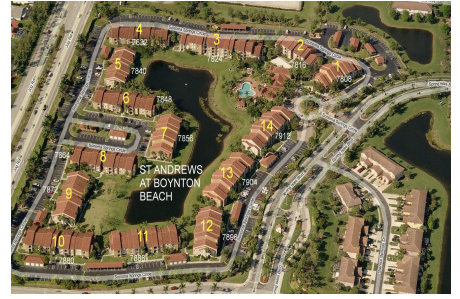
Built in 1999 - 264 units - 3 floors

St Andrews 7800 Sonoma Springs Cir, Lake Worth, FL 33463 (561) 968-3143