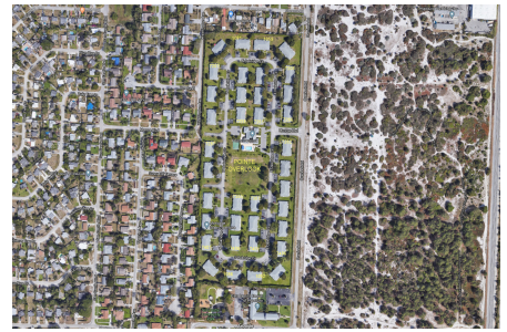
Built in 1974 - 148 units - 1 floor

Pointe Overlook Condo Association Inc 7275 East Oakridge Circle Lantana, FL 33462 (561) 586-0477