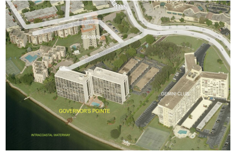
Built in 1984 - 117 units - 12 floors

Governor's Pointe Condo Association 356 Golfview Rd, North Palm Beach, FL 33408 (561) 775-9728 Bristol Management Service Inc 1201 US Highway 1 # 330 North Palm Beach, FL 33408 Phone: (561) 575-3551