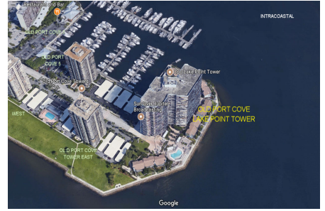
Built in 1982 - 177 units - 23 floors

Old Port Cove Corporation 1200 US Highway No 1 North Palm Beach, FL 33408 Phone: (561) 626-1350