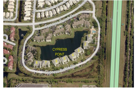
Built in 1982 - 90 units - 2 floors

Cypress Point Condo Assoc., Inc. 191 Cypress Point Drive Palm Beach Gardens FL 33410 Phone: 561-776-0907 Fax: 561-627-7226 Email: cypresspointpga@comcast.net http://www.cypresspointpga.com/