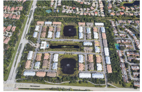
Built in 2014 - 192 units - 2 floors