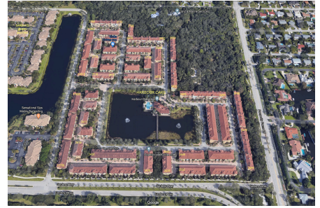
Built in 2005 - 317 units - 3 floors

Harbour Oaks HOA Address: 2500 San Pietro Cir, West Palm Beach, FL 33410 Phone: +1 561-622-6949