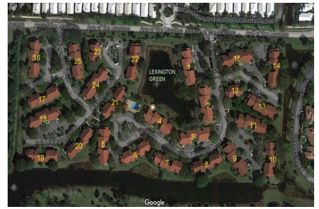
Built in 1986 - 192 units - 2 floors

Lexington Green Condo Assn 300 Avenue Of Champions Palm Beach Gardens, FL 33418 Phone: (954) 924-3071