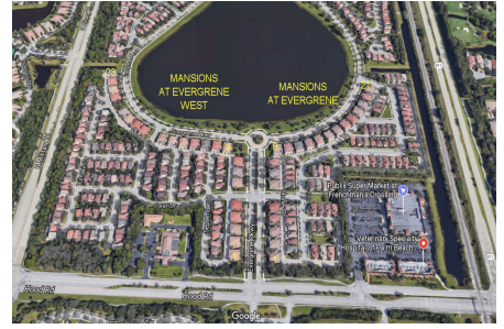
Built in 2002 - 63 units - 2 floors