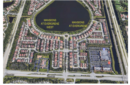
Built in 2004 - 68 units - 2 floors