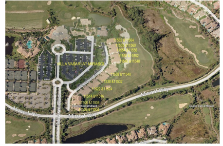
Built in 2005 - 32 units - 2 floors

VILLA VASARI AT MIRASOL CONDOMINIUM ASSOCIATION, INC. LANG MANAGEMENT COMPANY INC 21045 COMMERCIAL TRAIL BOCA RATON FL 33486 PHONE 561-750-8800 FAX 561-750-4528