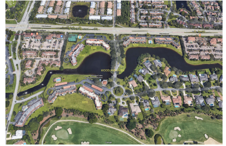
Built in 1977/1980 - 120 units - 4 floors

Woodland Lakes Homeowners Association Address: 5345 Woodland Lakes Dr, Palm Beach Gardens, FL 33418 Phone: +1 561-622-0500