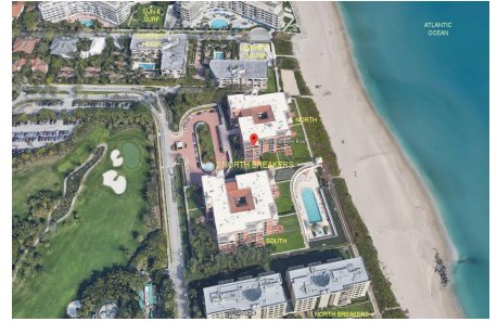
Built in 1986 - 47 units - 5 floors

Breakers Row Address: 2 N Breakers Row, Palm Beach, FL 33480 Phone: +1 561-659-2488