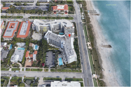
Built in 1985 - 43 units - 6 floors