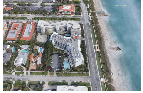
Built in 1985 - 43 units - 6 floors