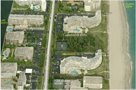
Built in 1968 - 94 units - 8 floors