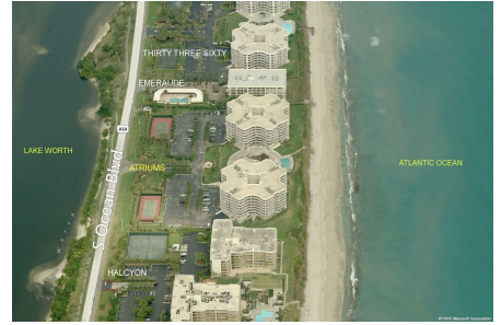
Built in 1979 - 106 units - 7 floors

The Atriums Of Palm Beach Condo 3400 South Ocean Boulevard Palm Beach, FL 33480 Phone: (561) 586-0005