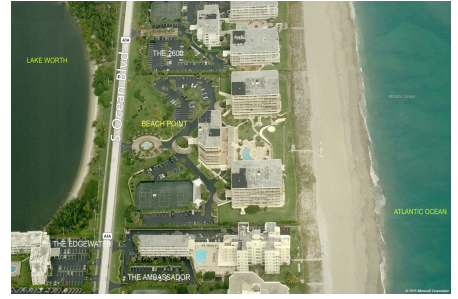
Built in 1979 - 105 units - 7 floors

Beach Point Condominium Association Inc, 2660 S Ocean Blvd, Palm Beach, FL 33480 - Phone: (561) 586-2648