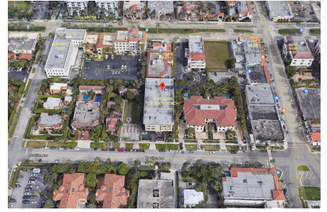
Built in 1970 - 24 units - 4 floors