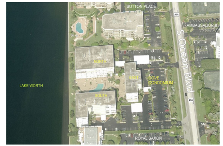
Built in 1975 - 79 units - 5 floors

The Cove Condominium The Cove Condominium 2784 South Ocean Blvd Palm Beach, FL 33480 (561) 585-6060 http://www.thecovecondominium.com/