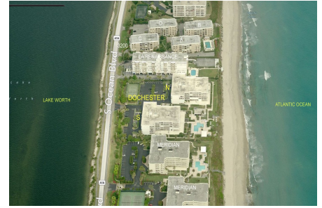
Built in 1979 - 100 units - 5 floors

The Dorchester of Palm Beach Condominium Association 3250 South Ocean Boulevard Palm Beach, FL 33480 561-586-3304 http://www.dorchesterpalmbeach.com/outside_home.asp