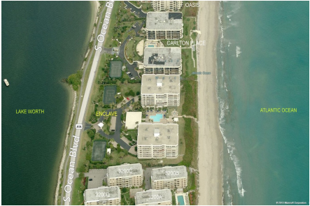
Built in 1985 - 72 units - 7 floors

Enclave of Palm Beach Condominium Association Inc, 3170 S Ocean Blvd, Palm Beach, FL 33480 Phone: (561) 582-1100