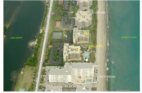
Built in 1980 - 104 units - 7 floors

Halcyon Of Palm Beach The Condominium Management 3440 S Ocean Blvd, Palm Beach, FL 33480 (561) 582-3952