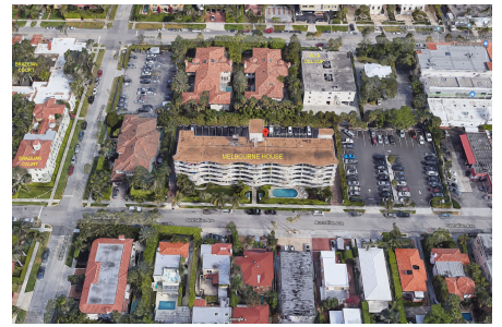
Built in 1985 - 25 units - 5 floors

Melbourne House Condominium Association, Inc 227 Australian Avenue Palm Beach, FL 33480 Phone: (561) 655-4783 (561) 655-7015