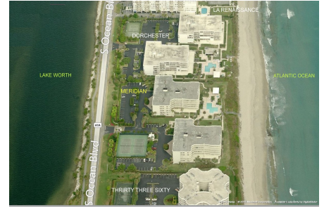
Built in 1981 - 79 units - 5 floors

Meridian Of Palm Beach Condominium Association Inc 3300 South Ocean Boulevard Palm Beach, FL 33480 Phone: (561) 582-9830