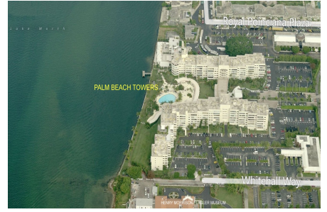
Built in 1956 - 258 units - 6 floors

Palm Beach Towers Condominium Association, 44 Cocoanut Row Palm Beach, FL 33480 - Phone: (561) 832-8511