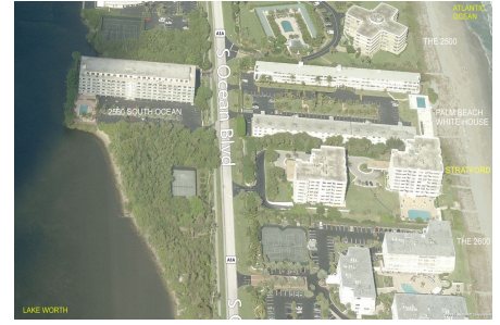
Built in 1979 - 42 units - 7 floors

Palm Beach Stratford Condo Association Inc, 2580 S Ocean Blvd, Palm Beach, FL 33480 Phone: (561) 586-0124