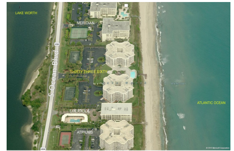
Built in 1980 - 89 units - 6 floors

The Thirty-Three Sixty Condo Association Of Palm Beach Inc, 3360 Condominium Association 3360 South Ocean Boulevard Palm Beach, FL 33480 Phone: (561) 585-4504