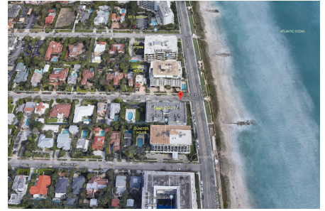
Built in 1975 - 23 units - 3 floors