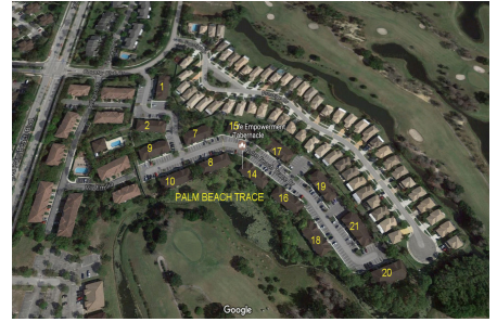
Built in 1991 - 112 units - 2 floors

Palm Beach Trace Condo Managed By: Management Associates, Inc. Main Phone: (561) 641-8554 (561) 578-8146