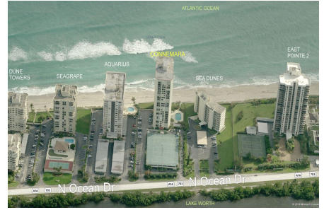
Built in 1979 - 137 units - 25 floors

Connemara Association Inc 5420 N Ocean Dr, Riviera Beach, FL 33404 (561) 848-8605