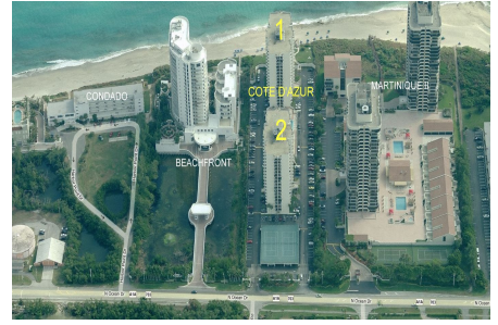
Built in 1975 - 204 units - 18 floors

Cote d'Azur Condominiu Association Inc 4200 N. Ocean Drive, Singer Island, Florida 33404 (561) 844-6259 agingerich@cotecondo.com http://www.cotecondo.com/outside_home.asp