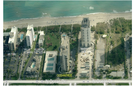
Built in 1978 - 146 units - 20 floors

Ocean Tree Condominium Association 3400 N Ocean Drive Apartment 107 West Palm Beach, FL 33404-3201 (561) 845-6050