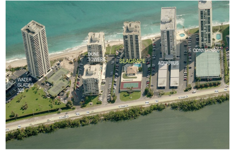
Built in 1973 - 60 units - 16 floors

Sea Grape Tower Assn Inc 5460 N Ocean Drive Riviera Beach, FL33404-2548 (561) 848-0969