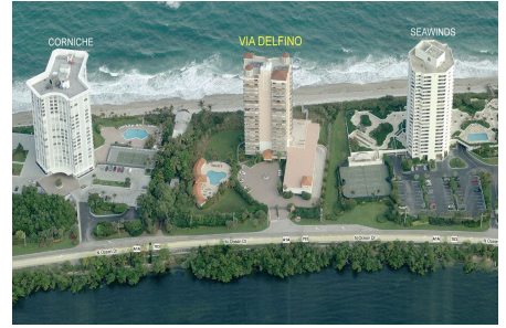
Built in 2003 - 33 units - 20 floors

Via Delfino Condominium 5150 N Ocean Drive Riviera Beach FL33404 (561) 841-8500