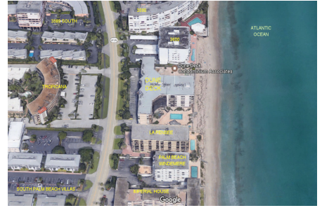
Built in 1980 - 65 units - 6 floors

Dune Deck Condominium Association Inc 610 South Ocean Boulevard Apt 309 Palm Beach, FL 33480 Phone: (561) 588-4747