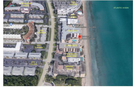
Built in 1985 - 24 units - 6 floors

La Pensee Condo Asoc 4000 South Ocean Boulevard Palm Beach, FL 33480 Phone: (561) 585-3084