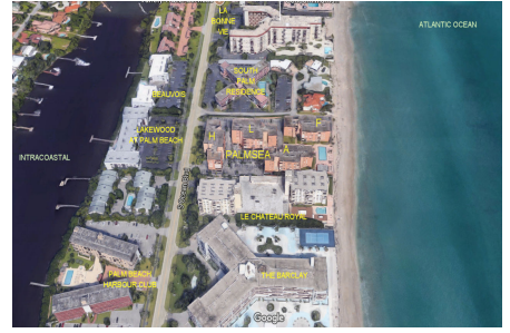
Built in 1973 - 121 units - 5 floors