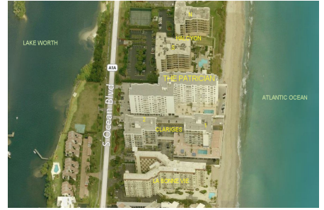
Built in 1971 - 211 units - 8 floors

Patrician The of Palm Beach 3450 S Ocean Blvd Palm Beach, FL 33480 Phone: 561-588-4313